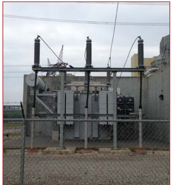
Completed G&W PAT-140 terminations.